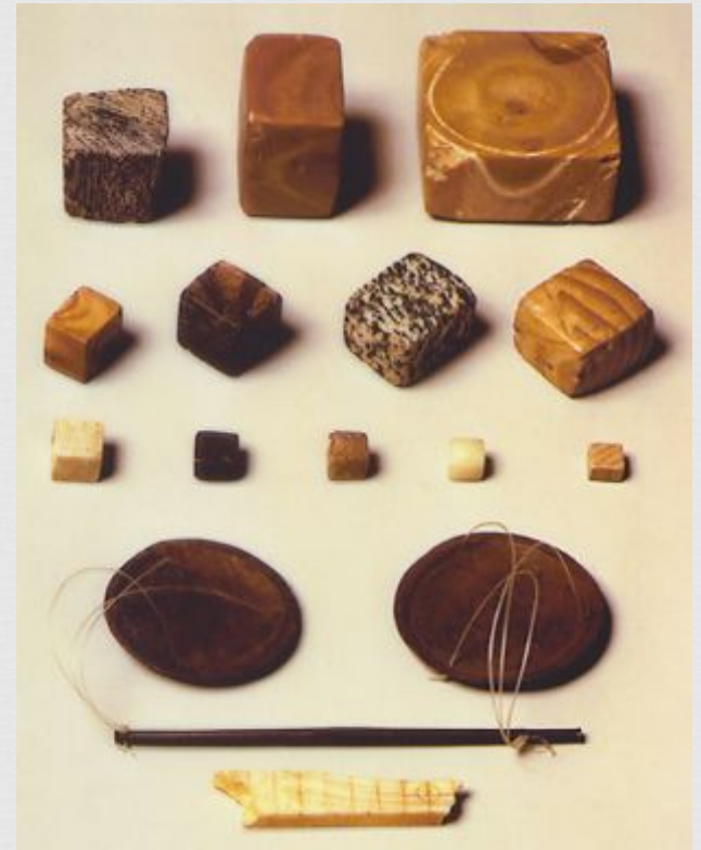
Standardized weights and scale