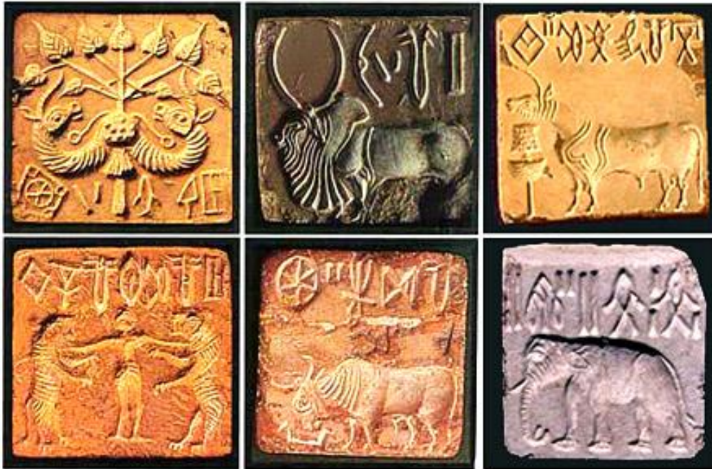
Ceramics or the clay tags labeling trade items